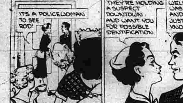
BOOTS AND HER BUDDIES BY EDGAR MARTIN

Taking Charge I'll take care of you. I'll take care of you. I'll take care of you.