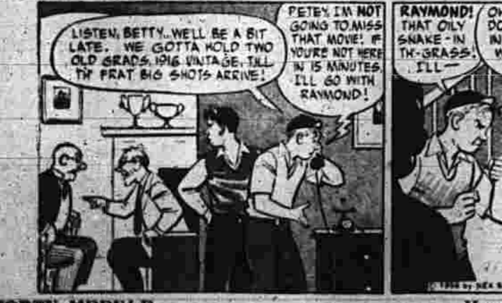
CAPTAIN EASY BY LESLIE TURNER

Difference of Opinion Listen, Betty, we'll be a bit late. Listen, Betty, we'll be a bit late.