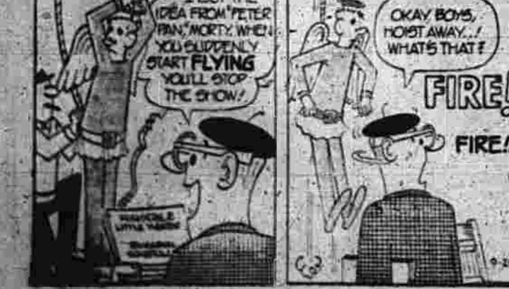
MORTY MEERLE BY DICK CAVALLI

Hanging High I got the green light. I got the green light. I got the green light.